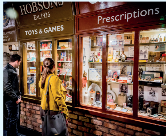
Amgueddfa'r Home Front | Home Front Experience