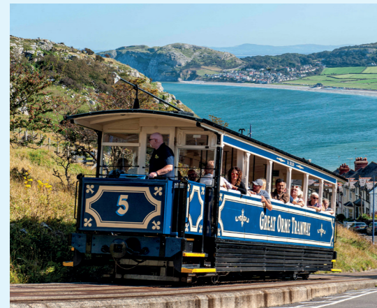
Tramfordd y Gogarth | The Great Orme Tramway